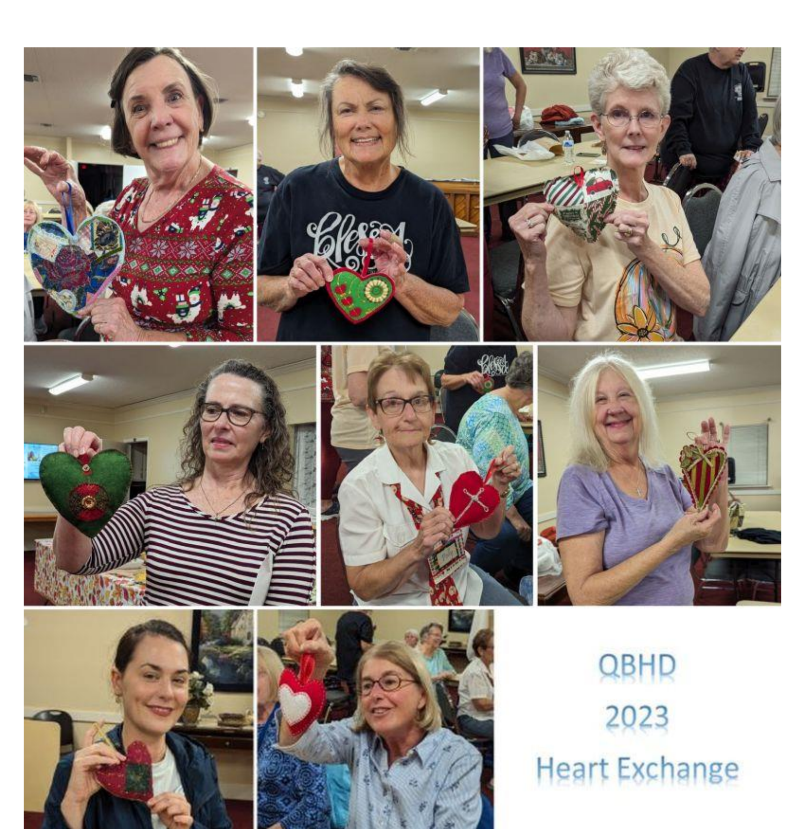
Members with the ornaments they received In the exchange.